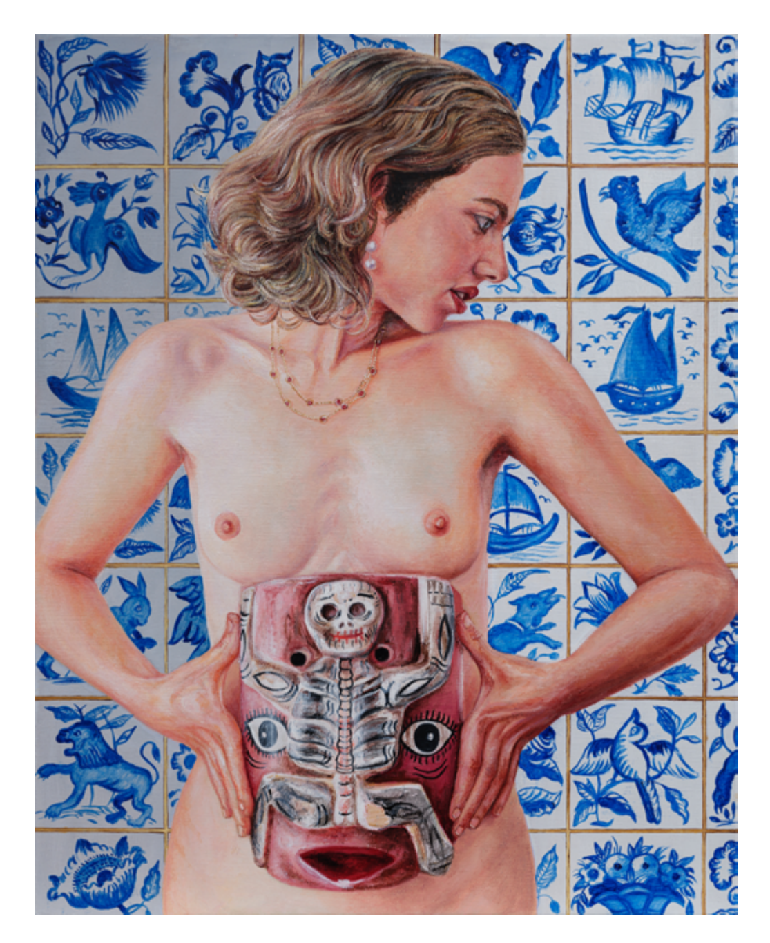
Madeleine au masque mexicain et l'Azulejos - 2022 Oil on canvas 50 x 40 cm

Through the works of the two artists, the stand will question and deconstruct the writing of our History.